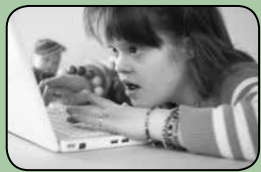
Sept 20, 2017

Wednesday afternoons from September 20th through October 11th, ATinNH will be presenting workshops on using assistive technology in schools. Workshops will be held from 3:30-5:30 at the Institute on Disability Professional Development Center, 56 Old Suncook Road in Concord.