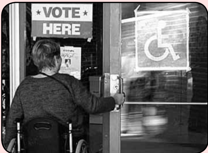
Your voice needs to be heard. Don't let New Hampshire's Voter ID bill stop you from voting!

If you have any problems accessing the polls on Election Day, call the Disabilities Rights Center toll free at 1-800-834-1721.